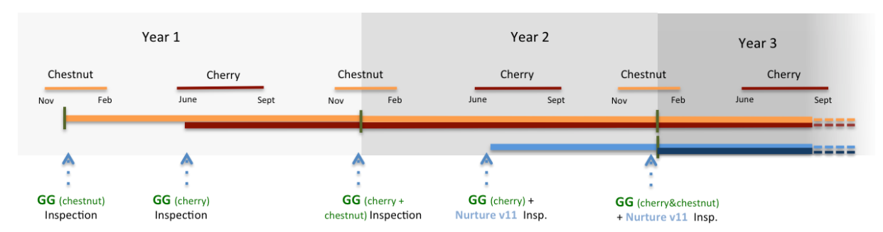
Year 1: The producer seeks IFA certification only, so the CB conducts a first visit during the harvest of chestnut and issues the certificate for this product for one year in year 1.

Example 1: An individual producer grows chestnut (harvest window between November and February) and cherries (harvest window between June and September).